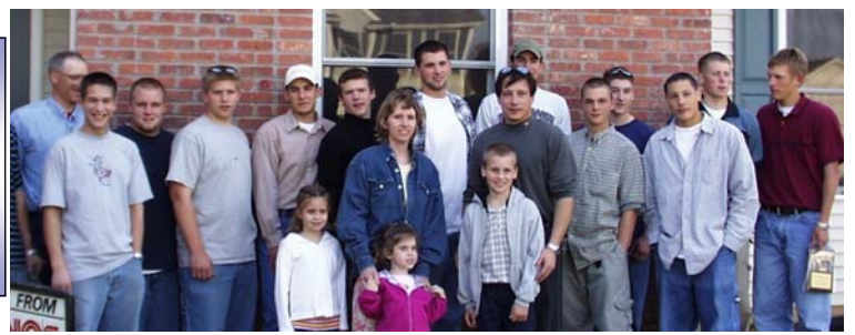
Pictured are students proudly standing in front of the finished 2002 Student Built Home with the family who purchased the house.